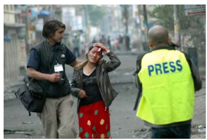
A press photographer assists a woman injured during Kathmandu street violence

station employs 17 journalists and manages to break even with a certain nominal level of donor assistance for content generation. Government ad placements also contribute significantly to the radio station's viability.