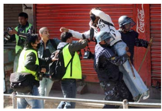
Journalists are often subject to strong-arm crowd control tactics while covering political demonstrations

with media proprietors being altogether too susceptible to political demands.