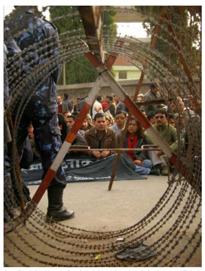
Journalists during the years of royal absolutism confronted tough situations on a daily basis

Reporting on issues and tensions related to ethnic diversity and inclusion, the traumas of past conflict and the fundamentals of current conflict, reconciliation and transitional justice, and democratic processes are especially relevant here. Journalists who follow the precepts of PSJ report in a responsible and ethical manner that promotes tolerance, understanding and unity between discordant factions and reduces conflict in society. More voices and