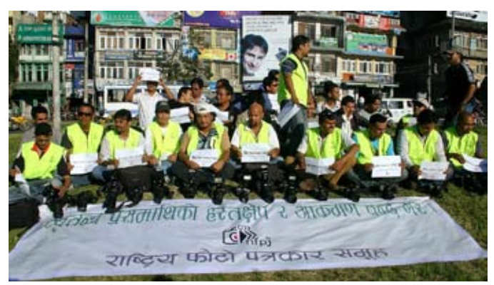
Photo journalists demonstrate against continued harassment and denial of access