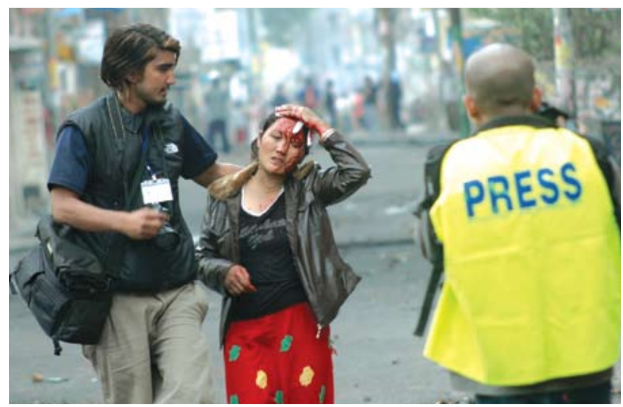
A news photographer helps a woman injured in street violence in Kathmandu

The conditions faced by local media in the districts were particularly harsh, caught as they were between the Royal Nepal Army and the Maoists. Pressure, coercion and direct threats to censor or alter news content were common. Media facilities and infrastructure were vulnerable to being shut down, deliberately damaged or removed by one or the other combatant side. The chain of production to distribution was liable to be disrupted to prevent the delivery of independent news. The emergence of armed vigilante groups in certain areas, particularly in the terai ahead of the peace process, also posed a serious threat to media practitioners.