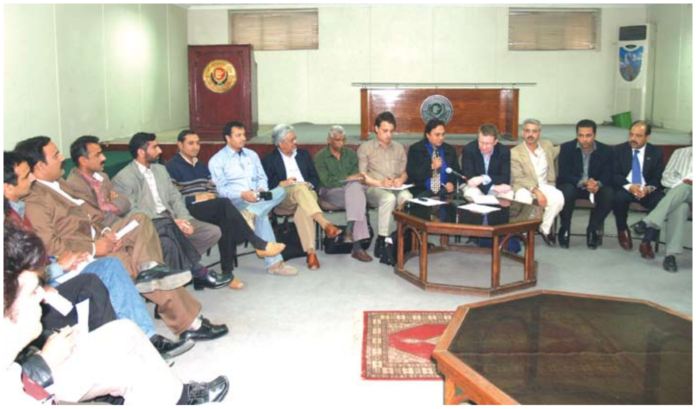
International press freedom missions to Pakistan have in recent times sought to establish the foundation for solidarity actions between local and global unions