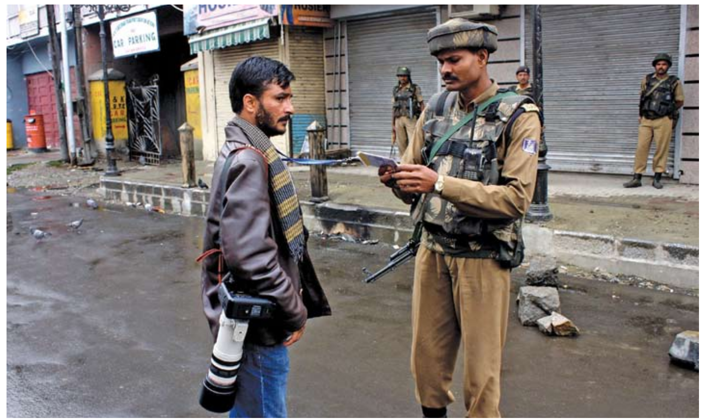
Kashmir's journalists have had a tough time negotiating the numerous restrictions imposed to curb recent disturbances

Early in July 2010, the Delhi Union of Journalists (DUJ), a constituent unit of the IFJ-affiliated Indian Journalists' Union (IJU), issued a strong statement deprecating the drastic erosion in the atmosphere for journalism, following