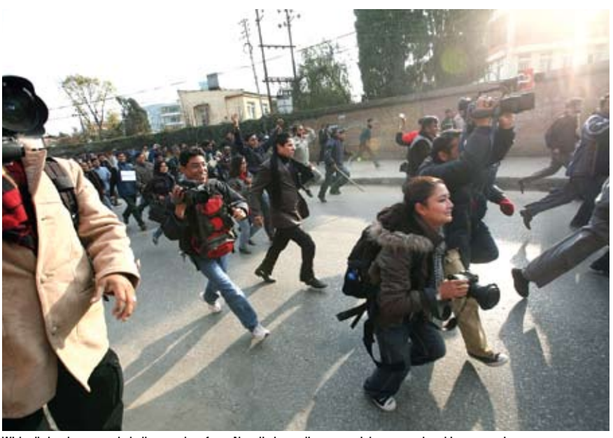
With all the threats and challenges they face, Nepal's journalists are quick to every breaking news site

After the 2005 royal coup, the Government banned the radio broadcast of news and news-related programs for six months. FM radio had transformed access to news and information on current events. Radio has also made newspapers more accessible through "what the papers say" segments. By cutting access to FM news, the king denied Nepalis a vital source of independent news, in a country