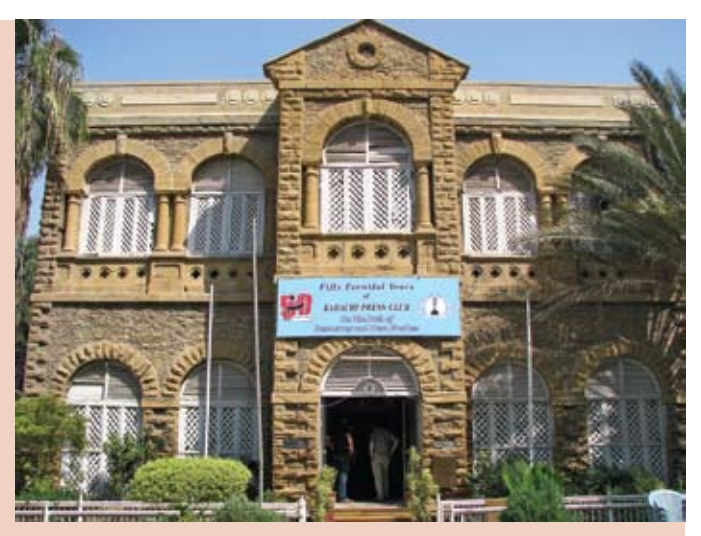
Karachi Press Club has in its heritage structure, been a vibrant node of media freedom activism

The return to martial law under Zia ul-Haq in 1977 saw also a return to crude methods of controlling the press and clamping down on democratic dissent. Editors and senior journalists were arrested and sentenced to rigorous