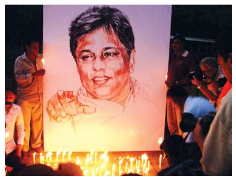
Candlelight vigil for murdered journalist Lasantha Wickrematunga, Colombo, January 2009

The repressive environment and the culture of self-censorship have made the coverage of humanitarian issues a major challenge. One of the casualties was fair and objective reporting on the situation of the nearly 300,000 IDPs corralled into detention camps in the North. What passed off as coverage often stemmed from carefully choreographed tours to the infamous Manik Farm, when journalists, mostly from the state media, accompanied government officials and foreign dignitaries as part of the entourage.