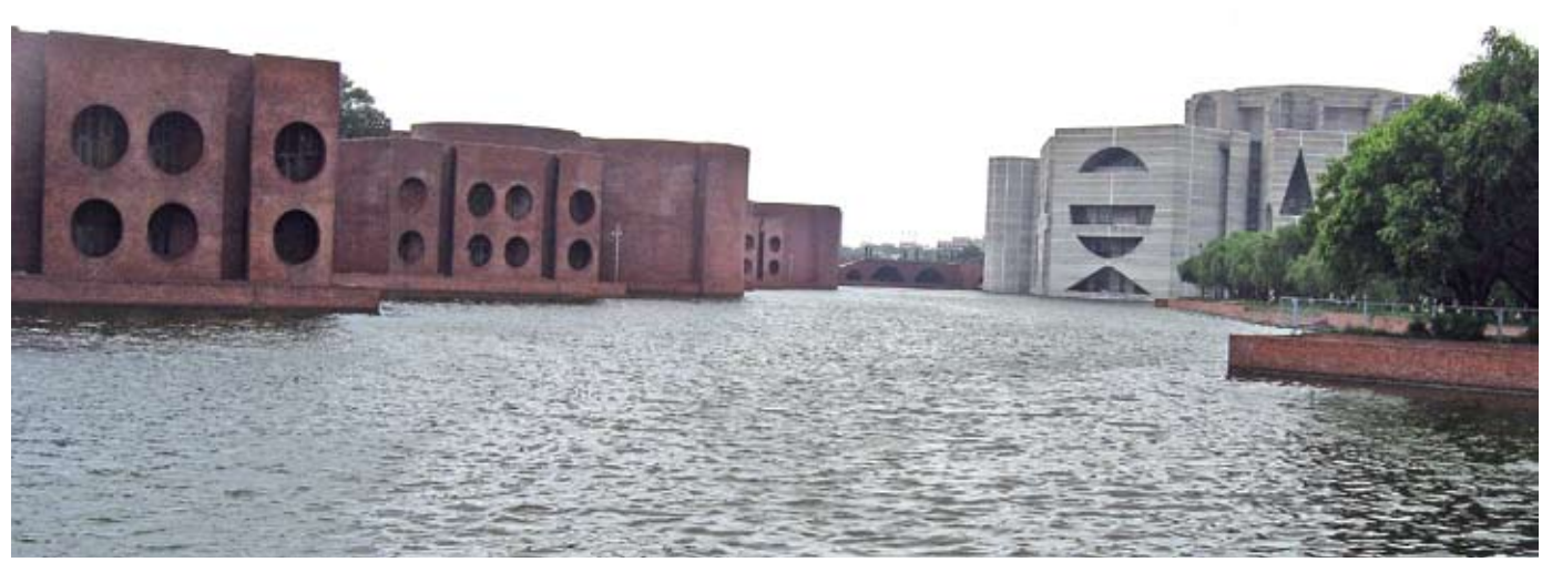
Parliament is not seen as a legitimate arena for oppositional politics, which is increasingly played out through the media and in the streets