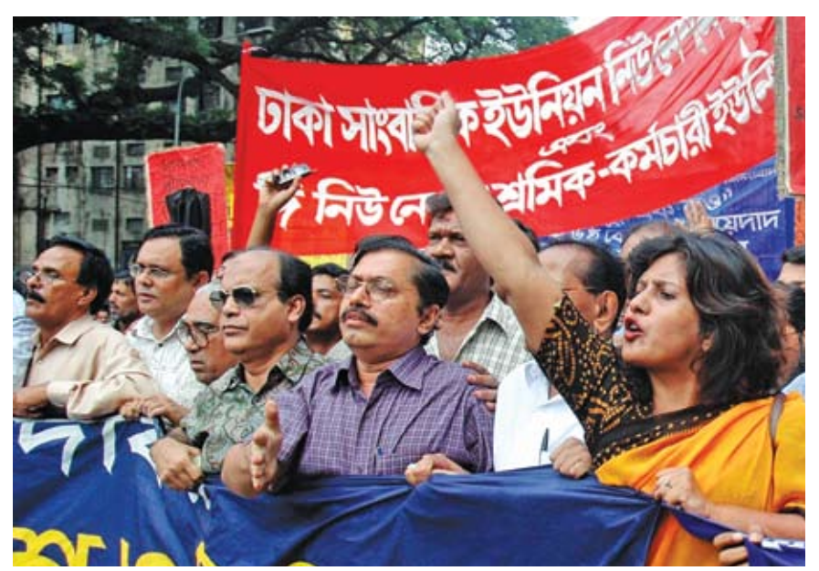
The emergency regime was tough on dissent, but journalists still organised to take legitimate grievances on to the streets

the interregnum between successive governments. But the breakdown of mutual trust between the national parties and the public mistrust of the integrity of national institutions became so deep that the entire democratic process was suspended and an "emergency regime" imposed, fronted by a group of civilian bureaucrats but in reality, underwritten by the power of the armed forces.