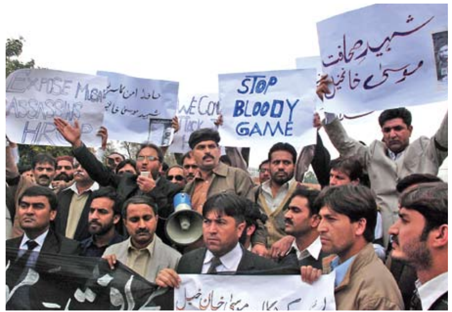
Journalists in Peshawar mobilise to protest the murder of Musa Khan Khel, February 2009

further and proceeded to take over the PPL newspapers when they refused to support the regime. While in some cases the management was able to subdue the staff, the PFUJ moved a resolution protesting the takeover.