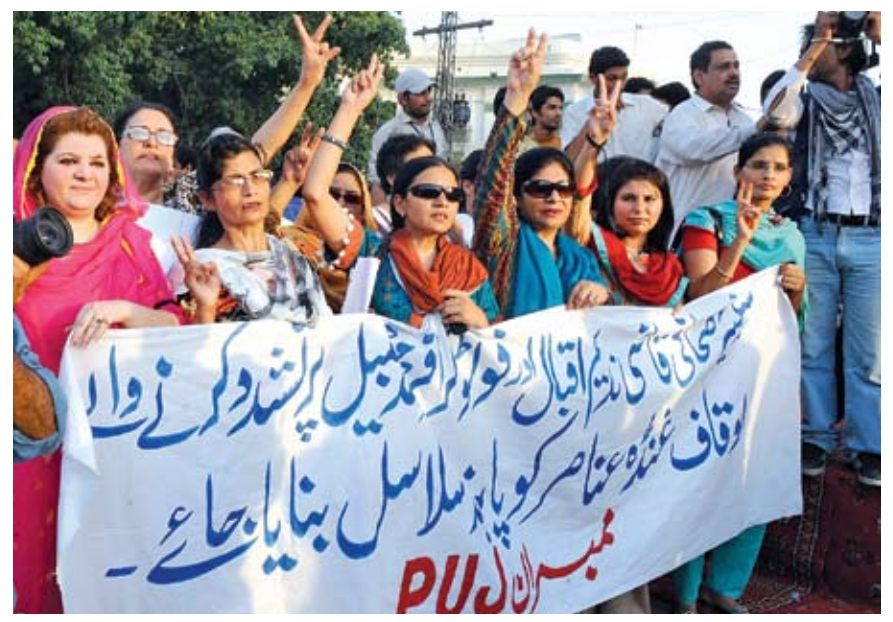
Women journalists have steadily increased their presence within the unions in Pakistan, but that has been an outcome of serious struggle

journalist Fahd Hussain notices a distinct shift in the media's attempts to strike a balance. "Until a year ago, there was ambiguity in the media, which was divided between anti-Taliban and those sympathetic to the Taliban," he says. "But after March-April of 2009, following the major military operation in Swat, there has been a sea-change in the media response. Suddenly, when the Taliban came closer to home, and entered Buner, just 60km from Islamabad, it jolted the media. Likewise, the video of the woman being flogged in public did a lot to change people's perceptions of the 'holy warriors'."