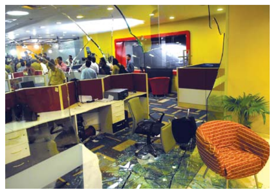
Vigilante attacks are a constant threat as Lokmat IBN TV discovered when it aired a discussion critical of a party that once led the ruling coalition in Maharashtra state

are suspected. The definition of "unlawful activities" again is over-broad and in terms of reporting these, even factual accounts of militant activity could often attract the accusation of "aiding and abetting" a banned organisation.