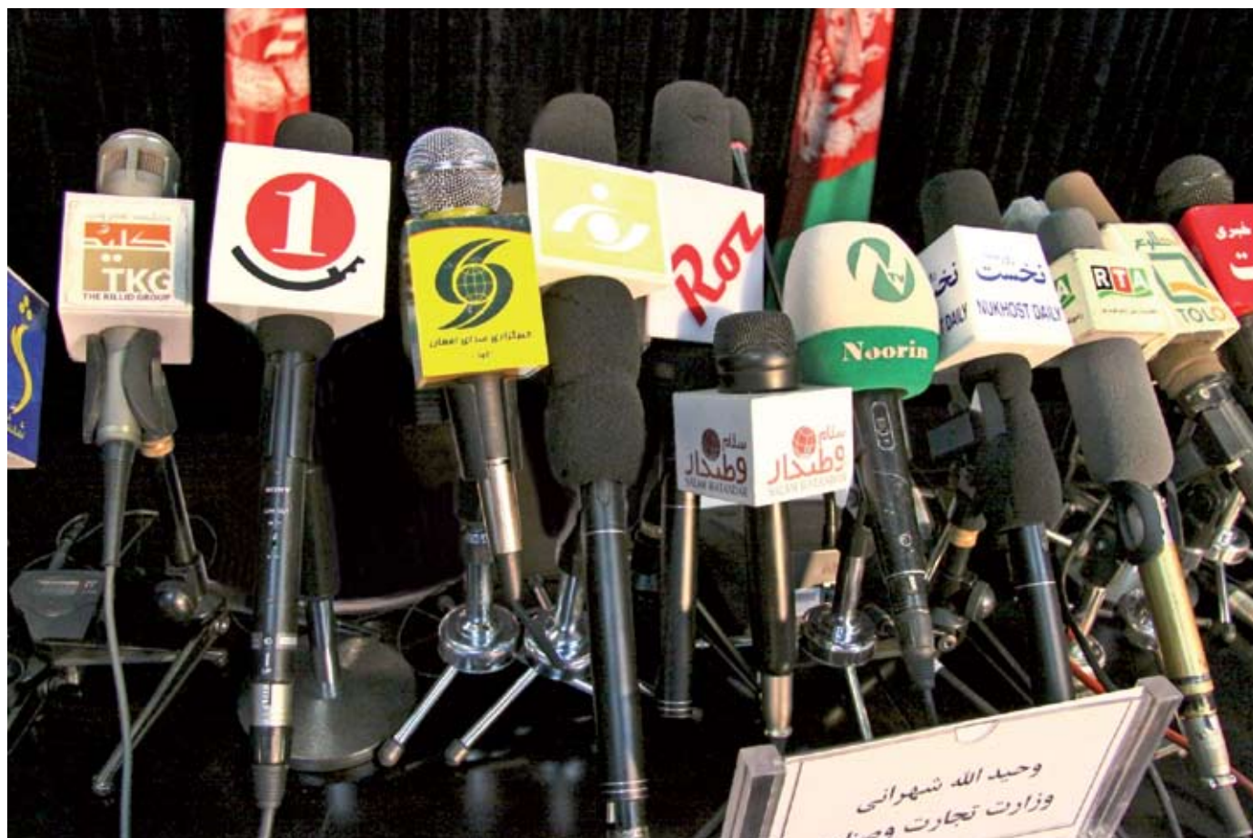
Recording microphones lined up at a press conference convey a picture of the growth and diversification of the media, though long-term sustainability remains a concern (Photo: Courtesy AJIA).

as donor fatigue and advertiser withdrawal. Kabul Weekly , one of the identified print publications which seemingly turned the corner and had begun to establish its credibility with advertisers and audience, has of late found itself in a financial crunch, ostensibly because governmental authorities have been withdrawing advertising support since the 2009 presidential election.