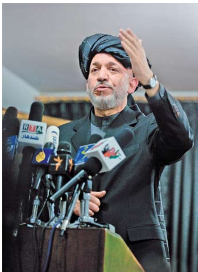
President Karzai gave his assent to a long delayed media law in 2010 but the record of implementation remains patchy.

The following months saw some progress in this regard, partially filling a gaping void in the media scenario in Afghanistan. For all the years since the fall of the Taliban Islamic regime, independent media in Afghanistan had expanded and diversified, though without a coherent regulatory framework or governance structure. Concurrently, there had been little headway in establishing social and political norms on the place of the media in a post-conflict society and the latitude available in terms of the constitutional right to free speech.