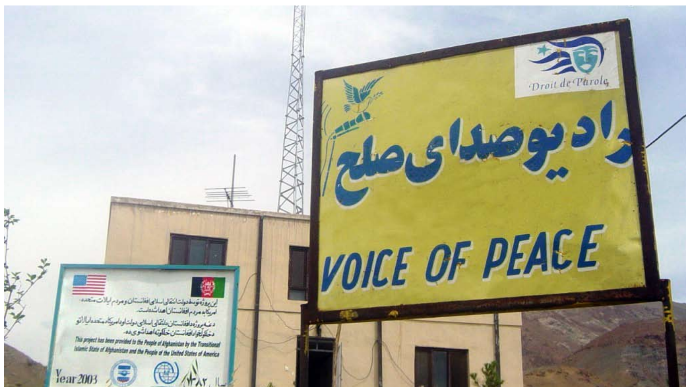
Radio has been a growth sector in the Afghan media though the dependence on donor support and advertisements placed by multinational forces in the country remains high.

The International Security Assistance Force (ISAF), which is in Afghanistan as the central coordinating body for all western partners in the military coalition, believes that it has turned the corner. According to its official statistics, 2010 saw more air strikes and special forces actions – including night raids and forced entries into civilian homes – than in earlier years. That it has managed despite all this to keep civilian casualties to a more moderate figure than the earlier year is regarded as a strategic triumph.