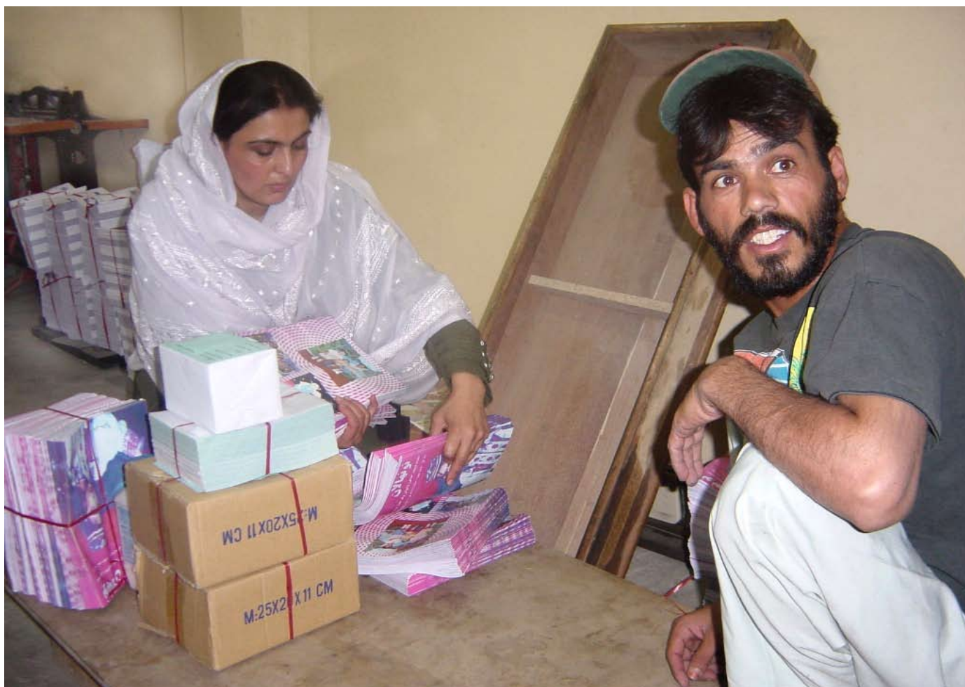
Certain among Afghanistan's print publications have established a niche in the market, though their long term viability remains uncertain.

conducted for their release, if any, remain opaque and there has been widespread criticism expressed over the manner in which the French and Afghan authorities have approached the matter.