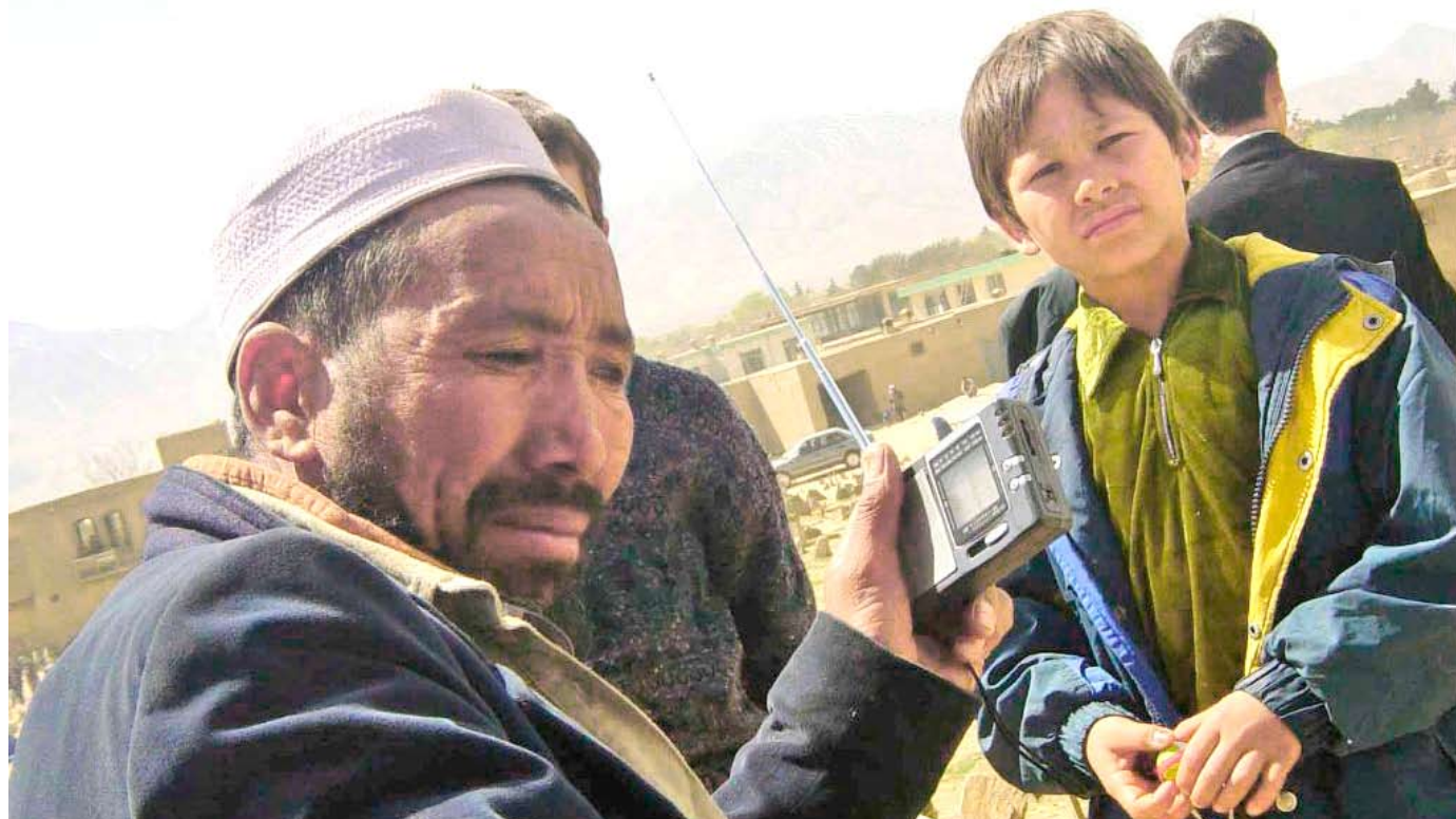
With print having a limited reach and TV being mostly concerned with entertainment, radio has become a primary source of news for most Afghans.