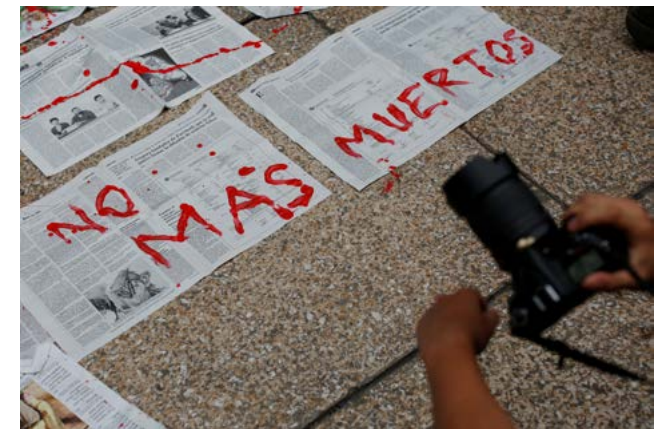
Journalists and activist paint on news papers with fake blood during a protest against the murder of the Mexican journalist Miroslava Breach, outside the Attorney General's Office (PGJ) in Mexico City, Mexico March 25, 2017. Papers reads with fake blood "No More Deaths"

The lack of political will and the shortage of answers from the authorities to tackle the crisis, not only worsened the safety situation but also led to censorship and self-censorship with regard to press freedom. This in turn has deprived the society of the right to information, thus undermining democracy in Latin America.