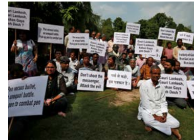
Journalists and social activists attend a protest against the killing of Gauri Lankesh, a senior Indian journalist who according to police was shot dead outside her home on Tuesday by unidentified assailants in southern city of Bengaluru, in Ahmedabad, India, September 6, 2017.