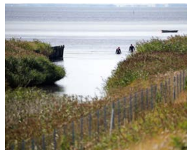
Members of the Danish Emergency Management Agency (DEMA) (Danish: Beredskabsstyrelsen) assist police at Kalvebod Fælled in search of missing body parts of journalist Kim Wall close to the site where her torso was found, in Copenhagen, Denmark, August 23, 2017.