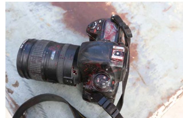
The blood stained camera of a photojournalist is seen after a secondary explosion in front of Dayah hotel in Somalia's capital Mogadishu, January 25, 2017.

These levels of violence and the lack of action to address the real issue of impunity are ground for African journalists and their organisations to further mobilise support and engage governments towards greater protection for media professionals. The safety of journalists on the continent remains a big challenge as journalists are consistently attacked, threatened and killed at will by those who feel aggrieved by their reports including the state cohorts and its security members. Those who kill journalists with the intent of silencing them must