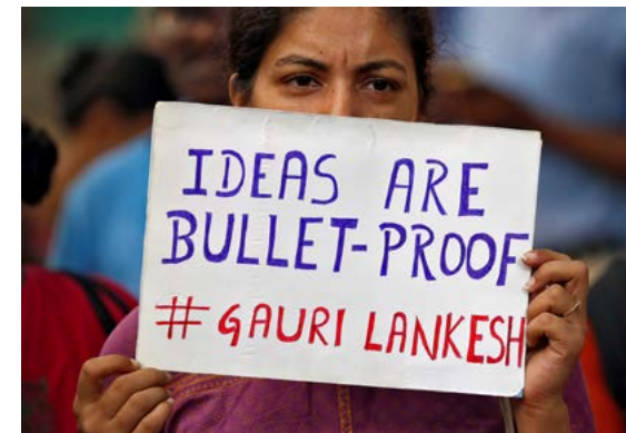
People attend a protest in New Delhi against the killing of Gauri Lankesh, a senior Indian journalist who, according to police, was shot dead outside her home on Tuesday by unidentified assailants in the southern city of Bengaluru, India, September 7, 2017.

There are still some notable gaping holes. In Bangladesh, India and the Maldives, it sadly seems that media workers' lives carry little regard in the wider state interests. So long as that climate remains, the numbers