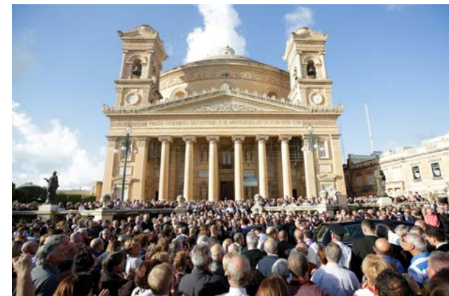
People attend a ceremony as a coffin of journalist Daphne Caruana Galizia, who was murdered in a car bomb attack, leaves the Rotunda Parish Church in Mosta, Malta, November 3, 2017.

The European Federation of Journalists recalls that European governments committed in April 2016 to establishing an independent national monitoring body to promote the protection of journalists, with the collaboration of journalists' unions and associations. No European state has yet delivered on that promise.