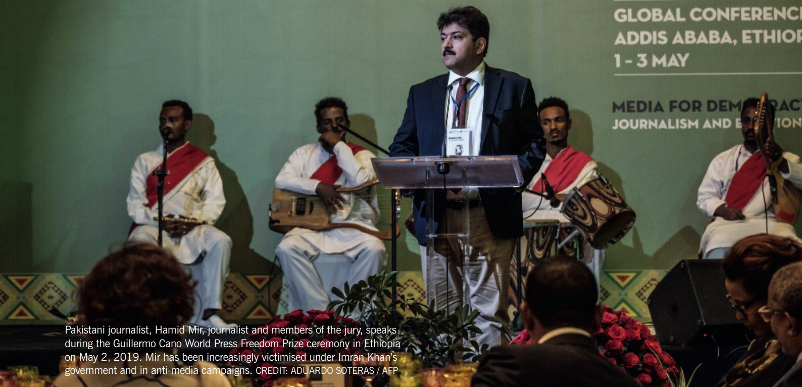
Pakistani journalist, Hamid Mir, journalist and members of the jury, speaks during the Guillermo Cano World Press Freedom Prize ceremony in Ethiopia on May 2, 2019. Mir has been increasingly victimised under Imran Khan's government and in anti-media campaigns.

MEDIA FOR DEMOCRACY JOURNALISM AND EDUCATION