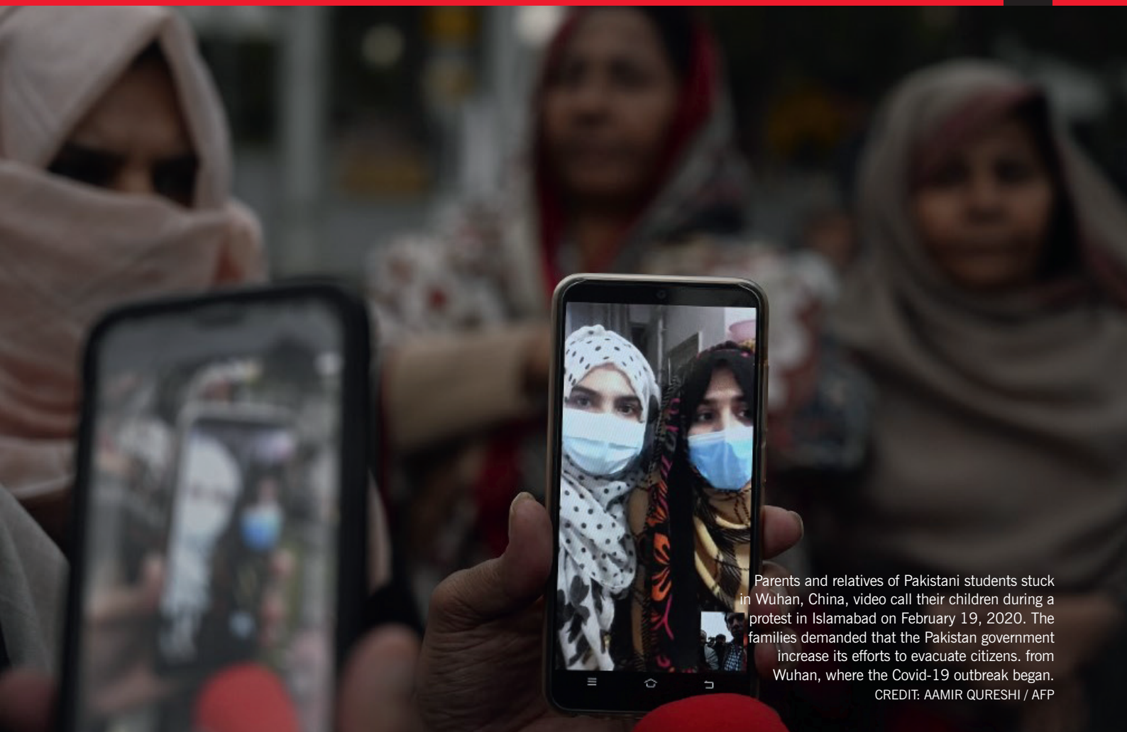
Parents and relatives of Pakistani students stuck in Wuhan, China, video call their children during a protest in Islamabad on February 19, 2020. The families demanded that the Pakistan government increase its efforts to evacuate citizens from Wuhan, where the Covid-19 outbreak began.