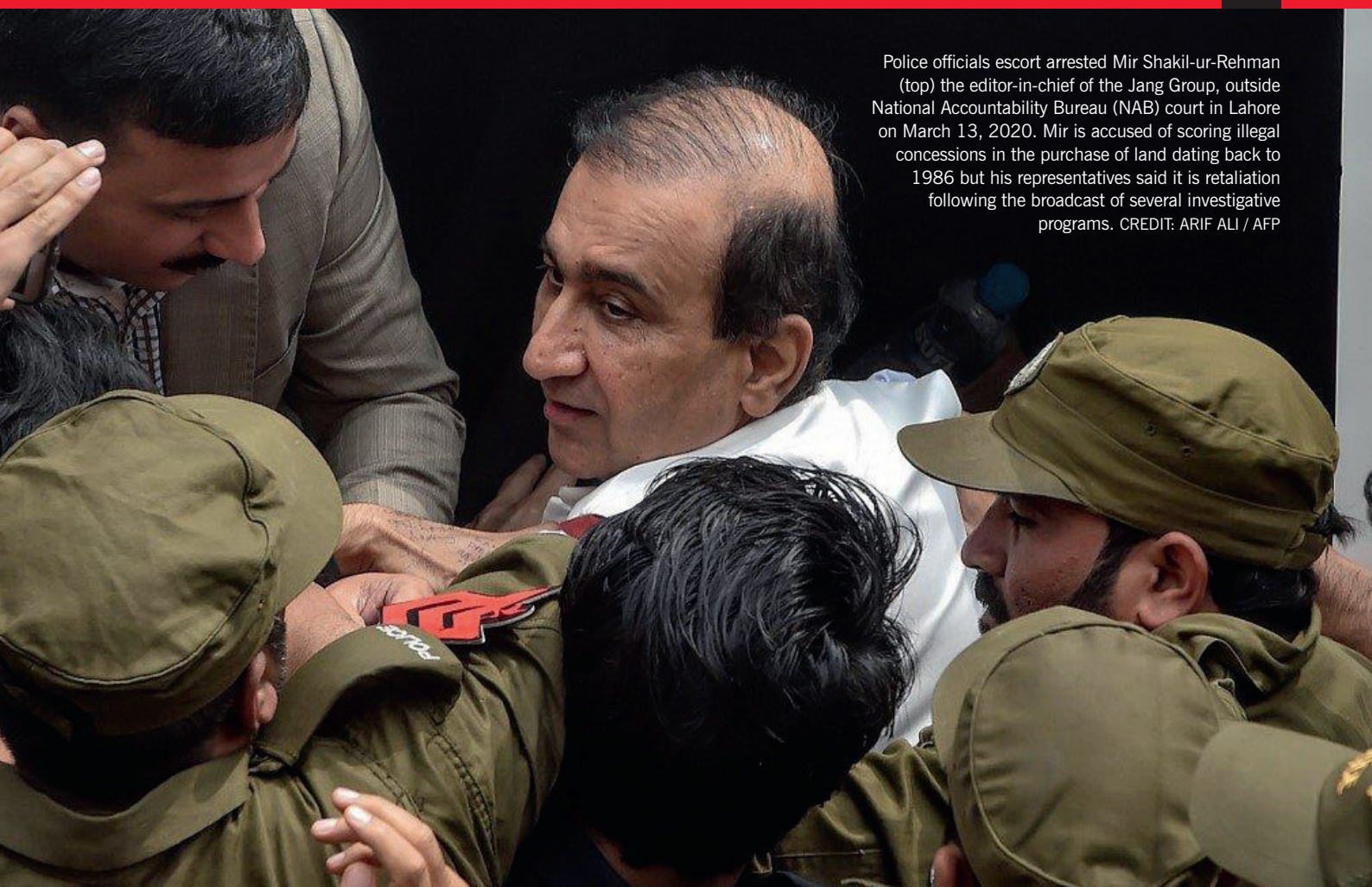
Police officials escort arrested Mir Shakil-ur-Rehman (top) the editor-in-chief of the Jang Group, outside National Accountability Bureau (NAB) court in Lahore on March 13, 2020. Mir is accused of scoring illegal concessions in the purchase of land dating back to 1986 but his representatives said it is retaliation following the broadcast of several investigative programs.

of the National Accountability Bureau (NAB), official anti-corruption agency. Rehman's arrest on March 12, 2020, in a property dispute case dating back to 1986, is seen as a part of the government attempts to clip press freedom. But struggling working journalists want salaries to be paid and exploitative employment conditions at the Jang Group to end even as they protest against Rehman's arrest. The group had closed down several of its publications, affecting scores of media workers.