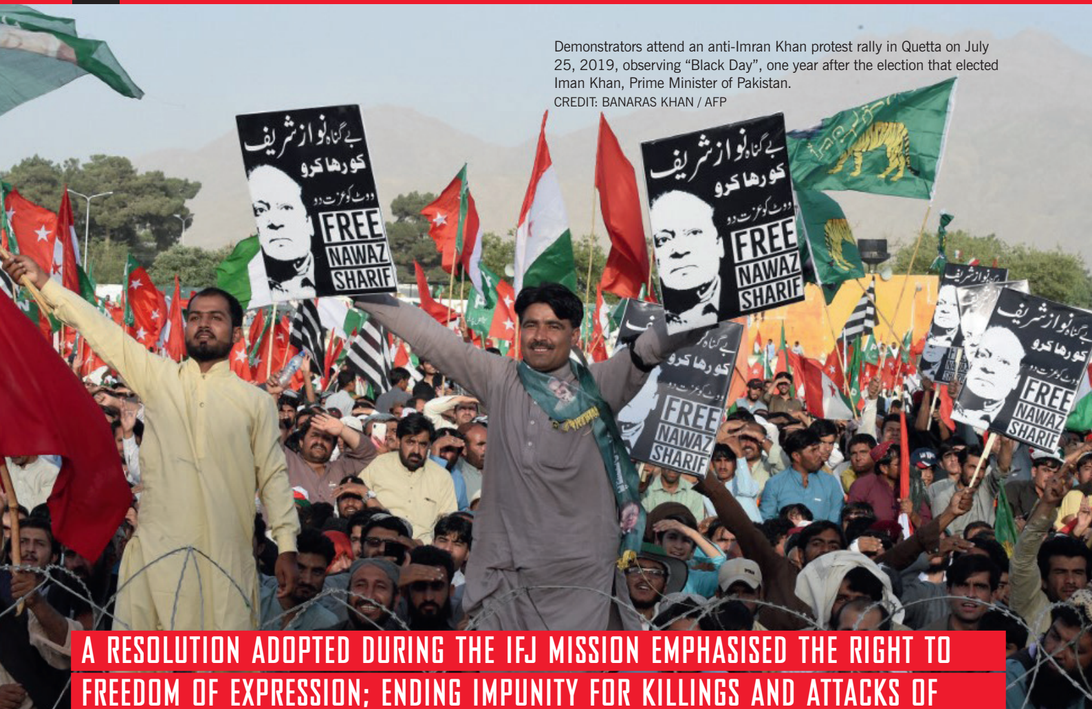
Demonstrators attend an anti-Imran Khan protest rally in Quetta on July 25, 2019, observing “Black Day”, one year after the election that elected Imran Khan, Prime Minister of Pakistan.