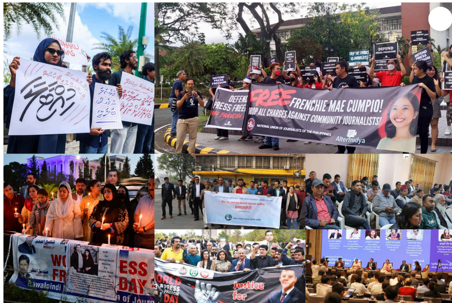
IFJ affiliates across the Asia-Pacific region mark World Press Freedom Day on May 3, 2023, including events in the Maldives (MJA), Nepal (FNJ), Pakistan (PFUJ), Cambodia (CamboJA), and the Philippines (NUJP).

Welcome to the IFJ's monthly media bulletin for South Asia's Media Solidarity Network (SAMSN)