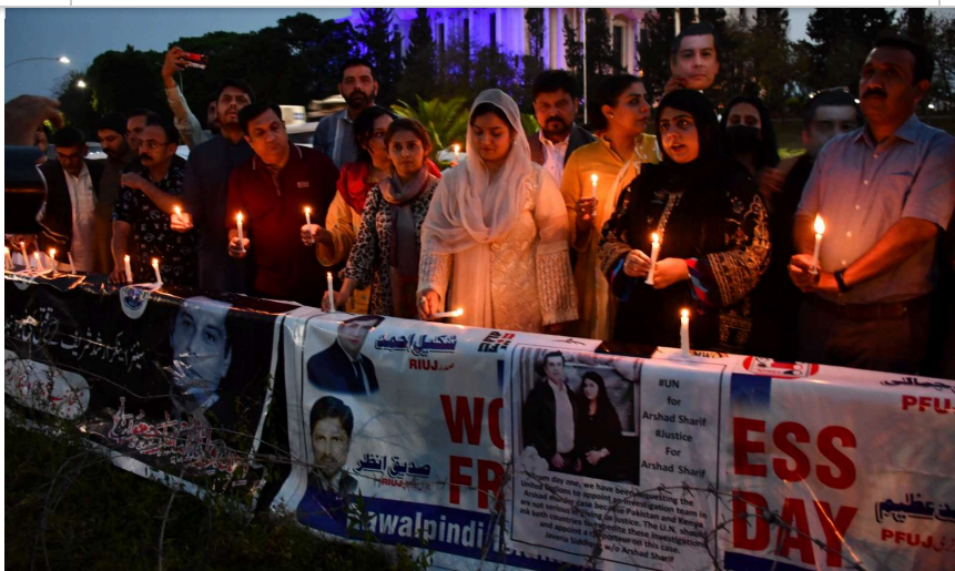
Members of the PFUJ participate in a rally on World Press Freedom Day on May 3, 2023.