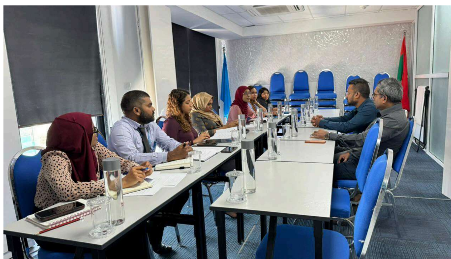
Participants and trainers from the IFJ's leadership training program in Islamabad, Multan, and Quetta.